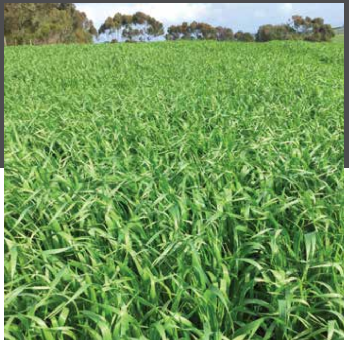
Scientific Name Avena sativa